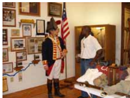
St. Charles, Missouri. A visit to the Lewis and Clark Boat House in St. Charles is always enhanced when members of the Discovery Expedition of St. Charles are available to talk with workshop attendees. Expedition members have lots of stories to share, after completing the two-year trek across the country and back, where they recreated the journey of Lewis & Clark during the Bicentennial of the famous expedition.

TIGRETT CORP—LEADERSHIP LESSONS FROM HISTORY